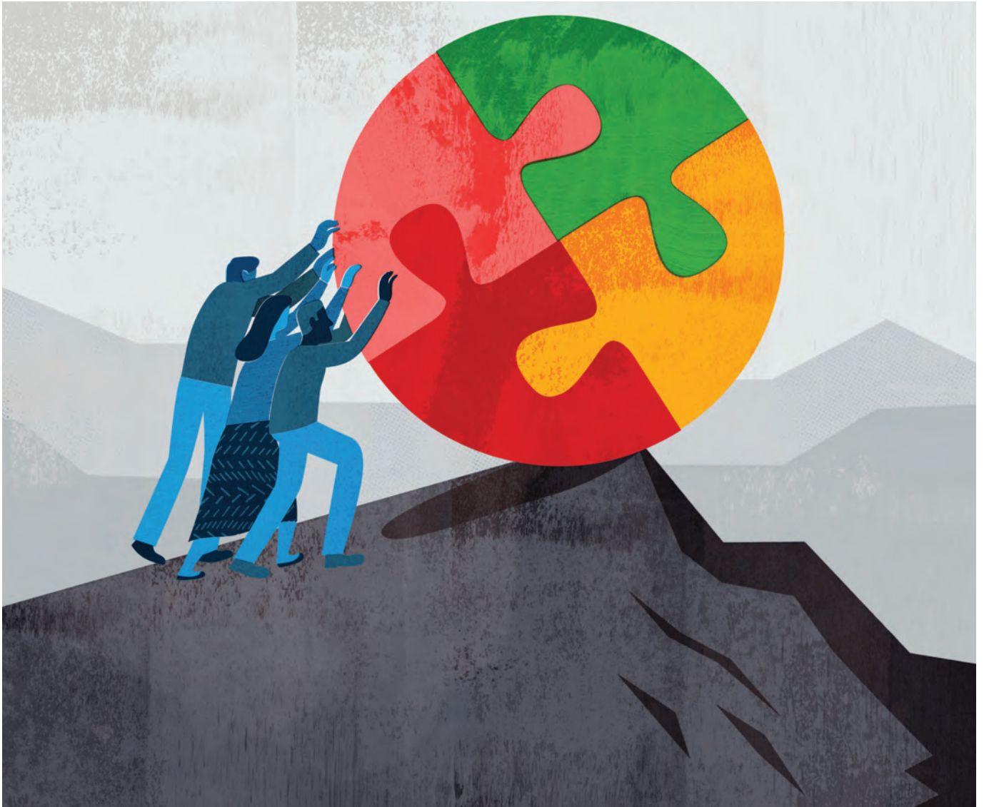
ILLUSTRATIONS BY MITCH BLUNT

juvenile arrests are down 24 percent, with no increase in crime or risk to public safety. 2